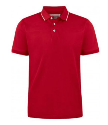
▶ JAMES HARVEST